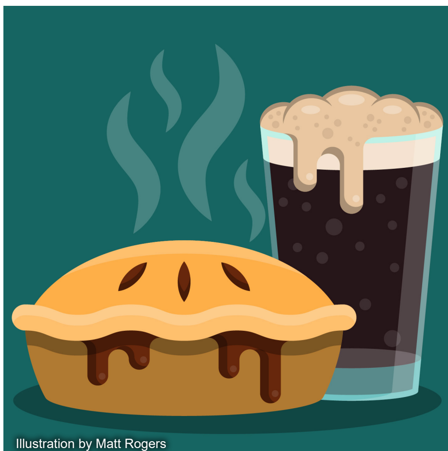
Illustration by Matt Rogers

It is hard not to fall in love immediately with The Perseverance upon entry, as it is the epitome of a quaint countryside pub. Oozing a cosy charm from the traditional wooden furnishings and