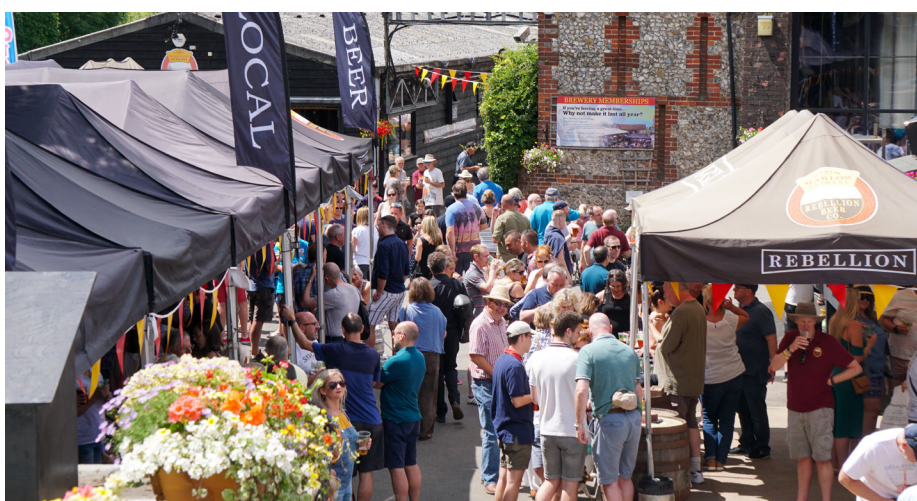
Above: Rebellion Brewery's charity weekends in previous years

Scannappeal is very much giving back to the local community."